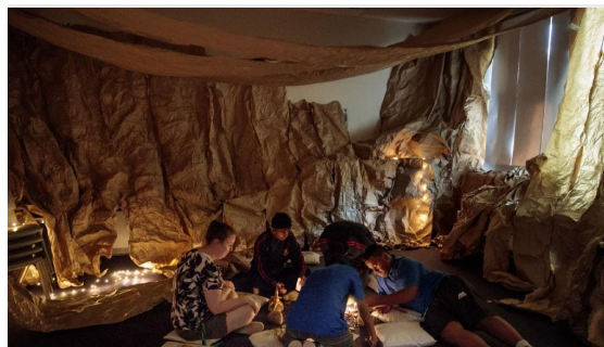
One hundred students in Years 7-10 took part in this year's program.

Liverpool Boys has been recognised for its innovative approach to education, having adopted a project-based learning model for students in Years 7-10. Next year, it will also move towards removing traditional grades.