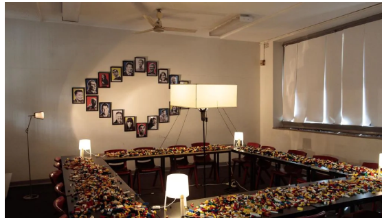
Classrooms were transformed into creative spaces.

He said one of the main goals of the program was to inject fun, excitement and curiosity in the boys’ learning.