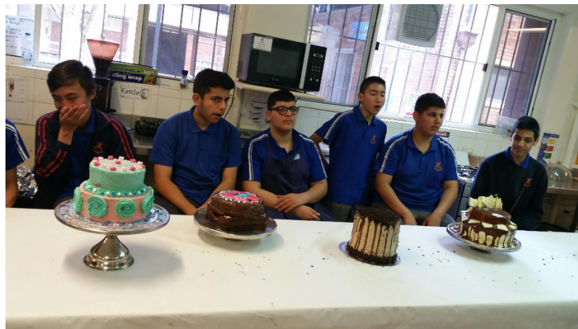
Figure 20 - Bake Off with Year 9