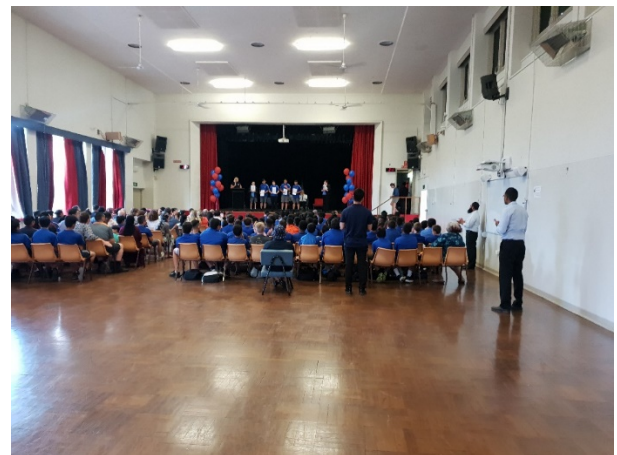
Figure 14 - Presentation of awards