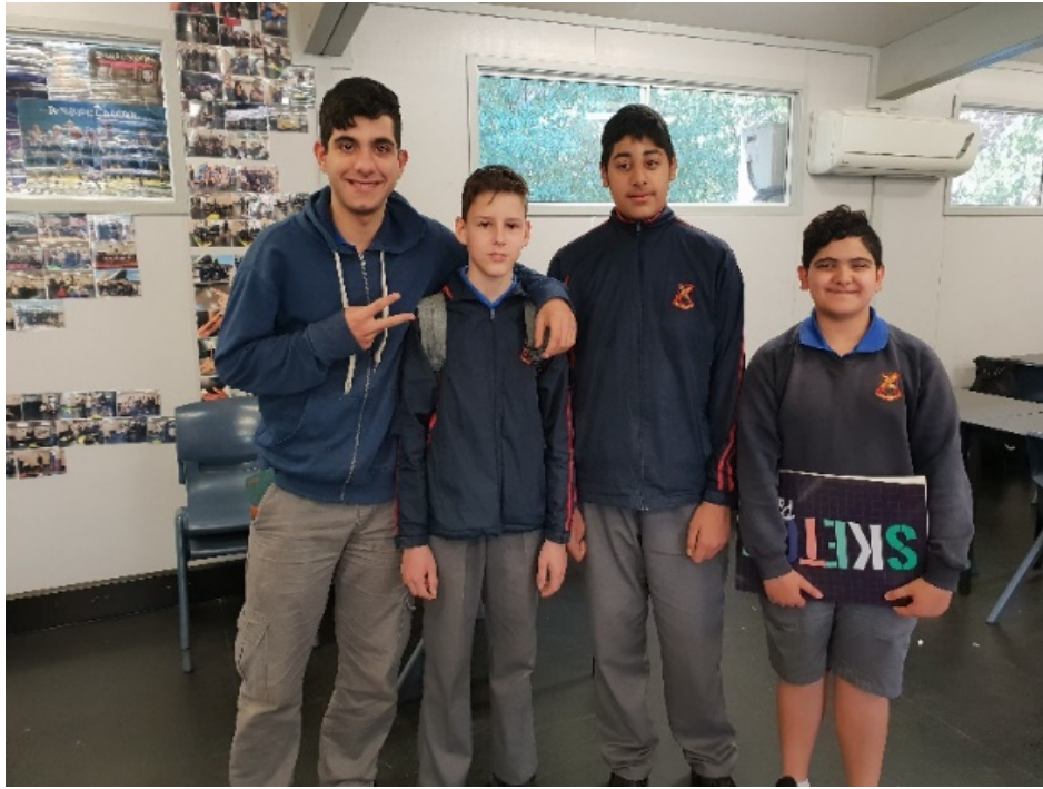
Figure 12 - Some of our boys who worked on the Visions of Peace project