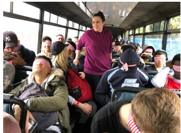
Figure 25 - On our way to the surprise picnic