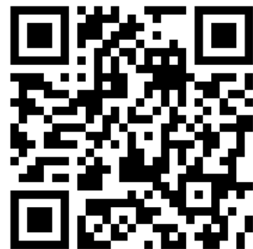
Figure 1 - Our QRCode to the website