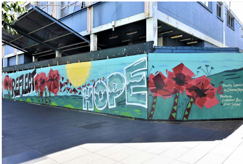
Figure 8 - The mural in Liverpool Plaza