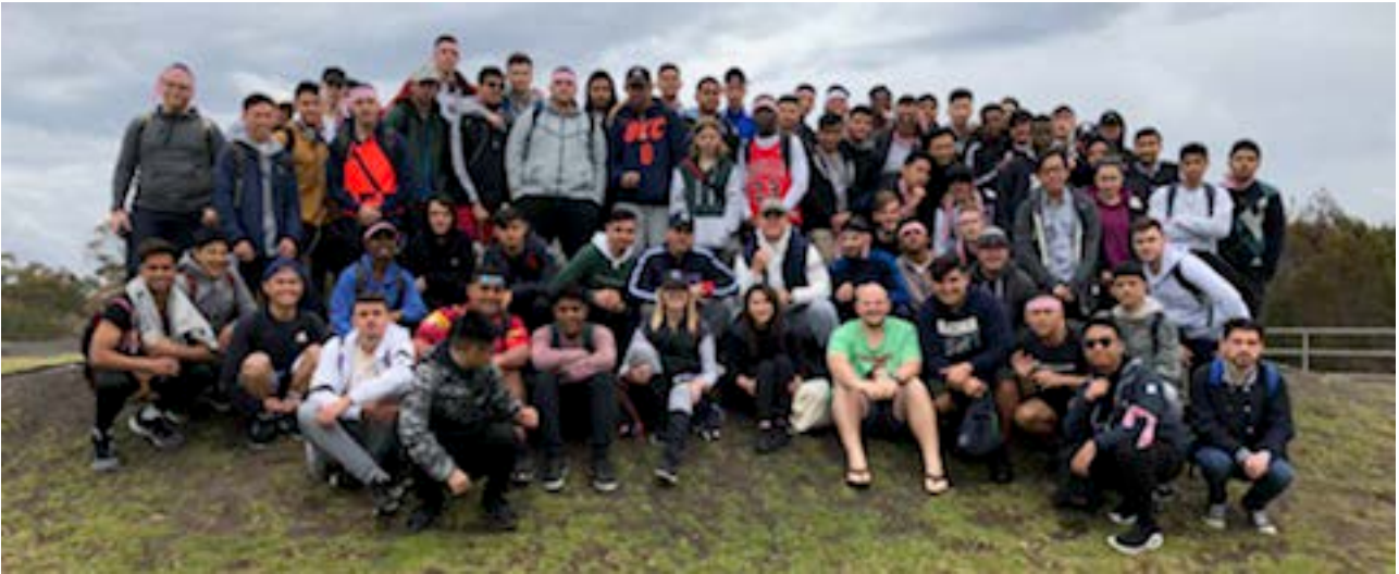
Figure 26 - Our College 2