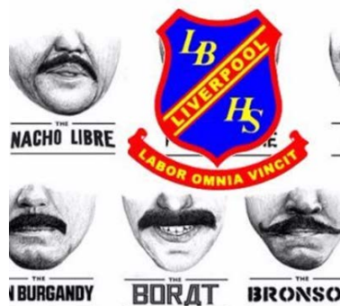
Figure 29 - Examples of famous Moustaches