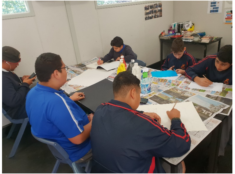
Figure 10- The boys working on their Visions of Peace before they were recorded