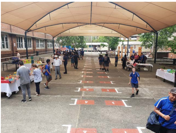
Figure 13 - Whole School Exhibition in the Quad

Thank you to all those who did attend, we appreciate every bit of support we receive!