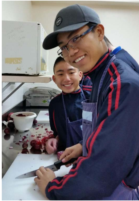
Figure 19 - Year 9 in the kitchen