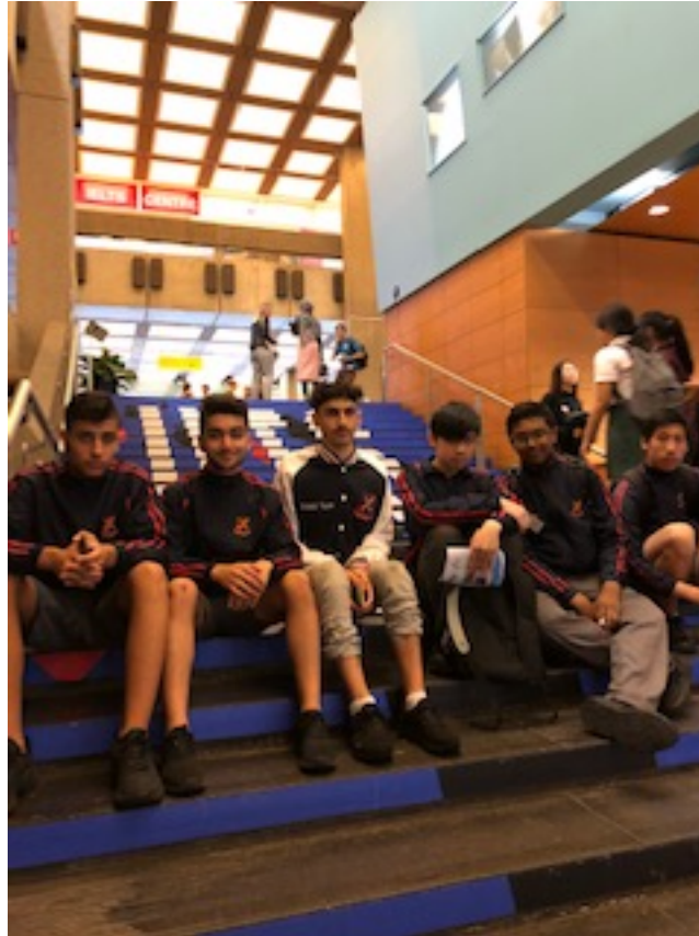
Figure 3 - UTS Summer School Orientation