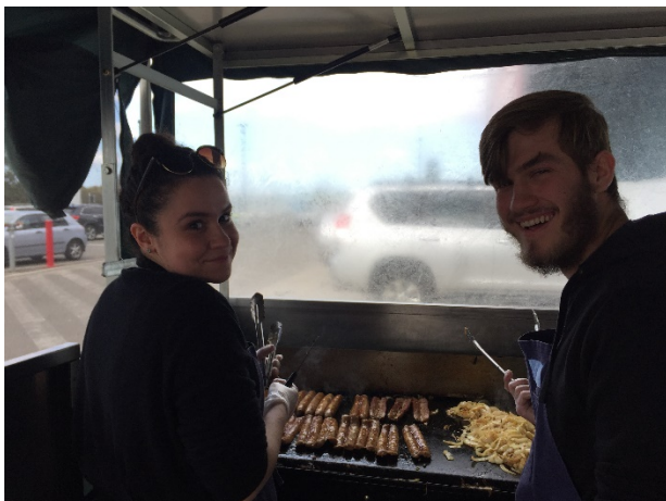
Figure 24 - Surprise Picnic