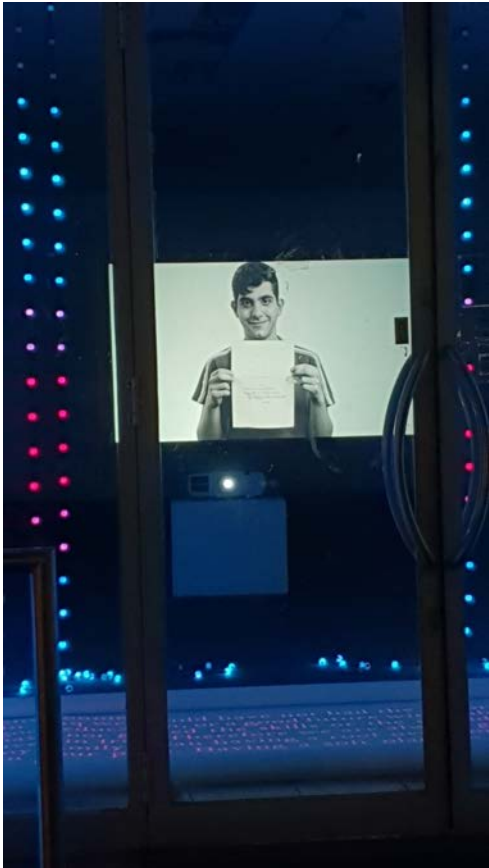
Figure 9 - One of the Visions of Peace videos