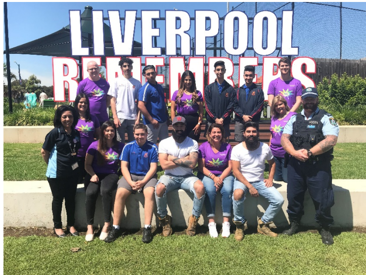
Figure 6 - Boys involved in the White Ribbon – Stop Domestic Violence with Liverpool City Council and Liverpool Police for Upcoming events and video promotion.

We were also happy to have some of our boys participate in the production of a video to promote Stop Domestic Violence, this will be seen on social media platforms during the week of White Ribbon Day. The boys were filmed with Liverpool Police and other community workers including the Knafeh Baker boys. There will be an evening event held in the Bigge Park on Friday 7 th December for Stop Domestic Violence and White Ribbon events will be held on Friday 23 rd November.