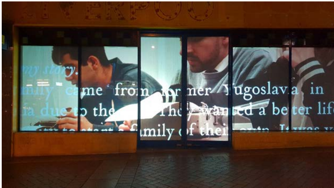
Figure 11 - One of the Visions of Peace Installations