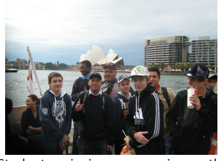
Students enjoying an excursion on the Harbour.