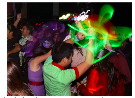
The light show was great at the Disco.